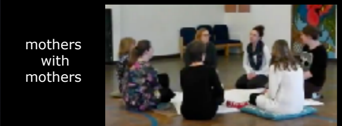
mothers with mothers