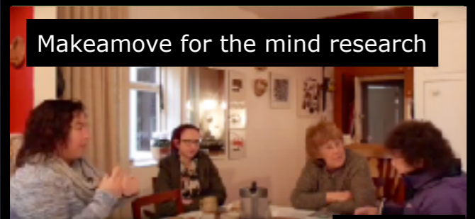
Makeamove for the mind research