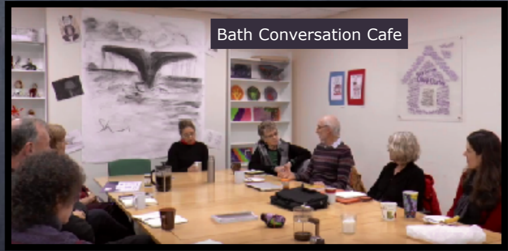
Bath Conversation Cafe

purposeful relationships in research to develop, evaluate + explain practice