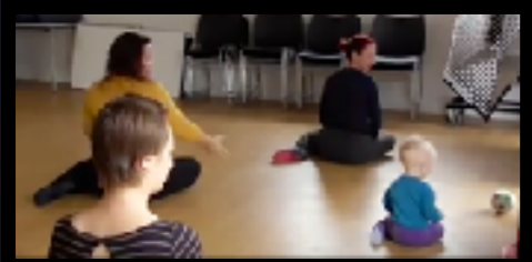
mothers with babies

purposeful relationships in research to develop, evaluate + explain practice