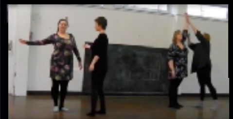
emotion + body awareness