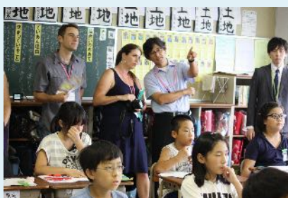
Japanese Lesson Study Day

About myself: My specializations are in educational psychology and educational research methods. At Waseda University Faculty of Human Sciences, I teach educational psychology, educational system assessment and research seminars. My recent research focuses on teacher expertise development, action research, lesson study, non-Western educational epistemology, inquiry-based teaching, achievement motivation, real world problem solving and the development of mathematical thinking.