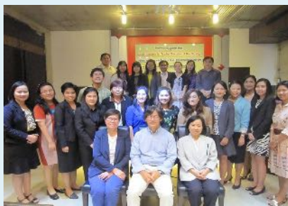
2015 IPST Action Research Workshop in Bangkok