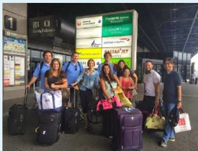
Action Research Tokyo Program