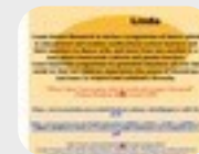
Linda Vargas Dance Educator

Use 'back key' to return to living-posters home page