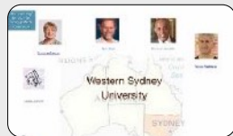
Western Sydney University group