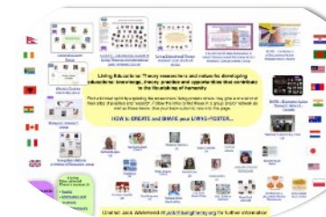
Living Educational Theory Researchers & other educational-practitioner researchers

"If I am not for myself, who will be for me? But if I am only for myself, what am I? If not now, when?" Hillel