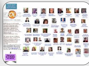
EJOLTS - Educational Journal of Living Theories An international peer reviewed journal

Click here to go to living-posters directory and archive