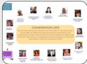
Conversation Cafe - a community based enquiry gp_UK