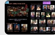
BARN - Bluewater Action Research Network - Canada