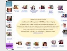
Living Educational Theory research post-doctoral SKYPE group