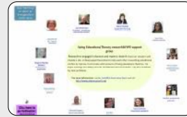
Living Educational Theory research SKYPE support group