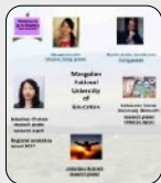
Mongolian National University of Education group