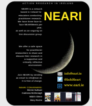
NEARI - the Network of Educational Action Researchers in Ireland