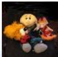
Ollie and friends

ARNA Montreal Proceedings https://sites.google.com/site/arnaproceedings/2019-proceedings?authuser=0