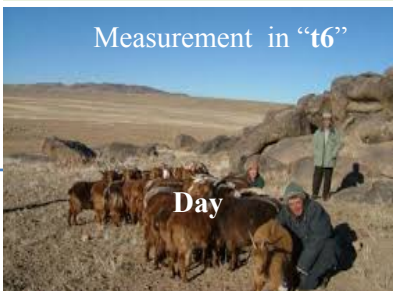
Measurement in “t6”

In one circling of tenger’s action inquiry have seven measurements. Each measurement has triangular investigation in junction of three moments.