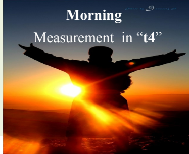
Morning Measurement in “t4”

Nomad’s research question - How is “Tenger/ Sky/ Celestial Dome”? Object – the action* of nature or animals (the view of nature and animals life) Subject - an action of tenger