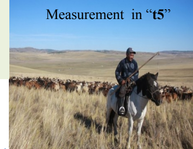
Measurement in “t5”

Theoretical background : Mongolian trio theory - ”Tenger – ACTION – nature”. ACTION=action – action*.