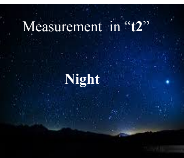
Measurement in “t2”

Mongolian spoken language and manuscripts are rich in facts of AR