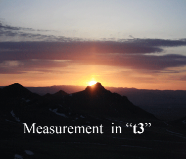
Measurement in “t3”

Nomad’s research question - How is “Tenger/ Sky/ Celestial Dome”? Object – the action* of nature or animals (the view of nature and animals life) Subject - an action of tenger