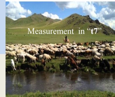
Measurement in “t7”