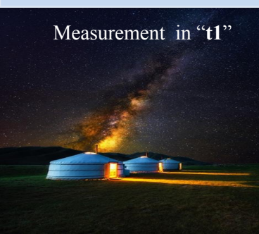
Measurement in “t1”

- AR is one of the versions of nomads tenger’s action inquiry. - Tenger’s action inquiry is a pragmatic version or AR in natural science