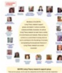
SKYPE Living Theory research support groups ...an international online community developing and supporting research and researchers