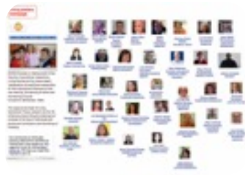
EJOLTS - Educational Journal Of Living Theories ...an international journal and community of Living Theory researchers