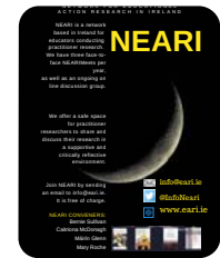
A network of educational researchers in Ireland