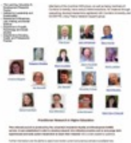
Univ. of Cumbria Living Theory Research gp. ...doctoral researchers & supervisors researching their diverse practice