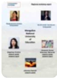
Mongolian Research gp democratization through education