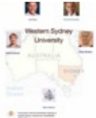
Western Sydney University group

Living Theory researchers and networks developing educational knowledge, theory, practice and opportunities that contribute to the flourishing of humanity. You can access some individual living-posters directly and others from the group/network pages. Dip in to find practitioner-researchers to share thoughts and values-based research with.