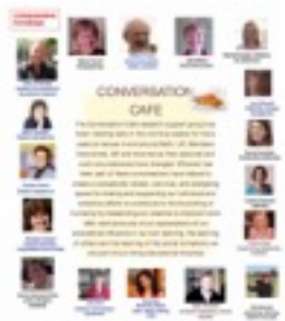
Conversation Cafe: A Living Theory community based in Bath, UK.s