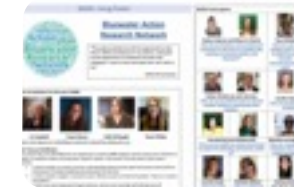
Bluewater Action Research Network ...a Canadian community of educators researchers