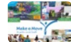
Make a Move Research Group promoting positive mental health