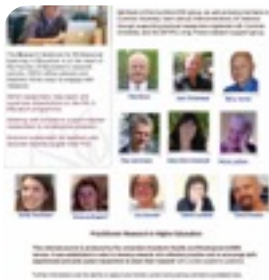
Univ. of Cumbria Living Theory Research gp. ...doctoral researchers & supervisors researching their diverse practice