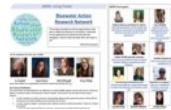
Bluewater Action Research Network ...a Canadian community of educators researching HE and school-based practice