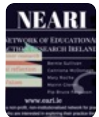
Network Educational Action Researchers of Ireland ...a developing network of educators in Ireland