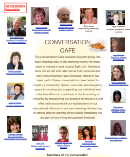
Conversation Cafe ...a community supporting developing practice in diverse fields meeting in and around Bath, UK, with occasional SKYPE visitors