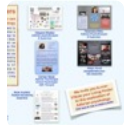
Adlerian SKYPE group Adlerian Living Theory researchers researching their practice together