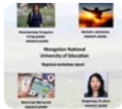
Mongolian Research gp democratization through education