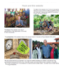
Revolution dressed Up as Gardening ...activists developing permacultural responses to improve the quality of life of communities around the world