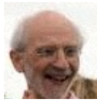
William House Community action, holistic medicine