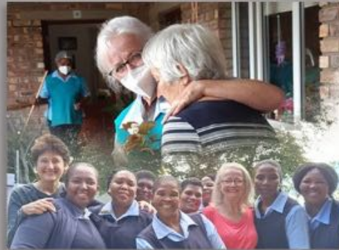
2020 to current Lockdown brought me to Kenton on Sea and back into life enhancing work in an old age nursing facility.