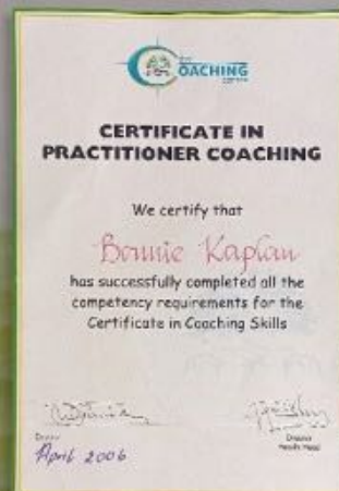
2000 to 2015 Coaching practice evolved alongside masters degree Living Educational Theory Masters