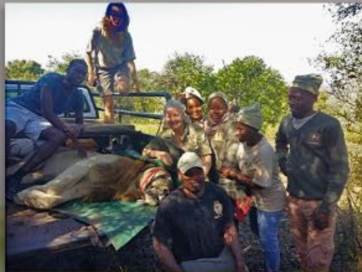
2015 Coaching and mentoring the Gumbi tribe who own Somkhanda Game Reserve to become entrepreneurs