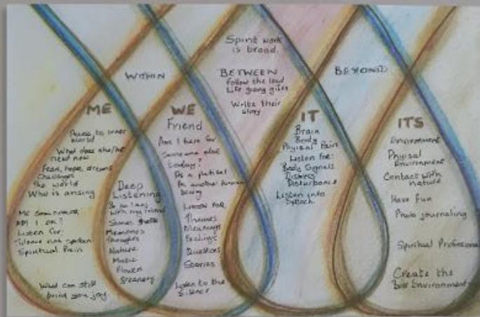
2020 Soul Carer training to accompany people with end of life illnesses