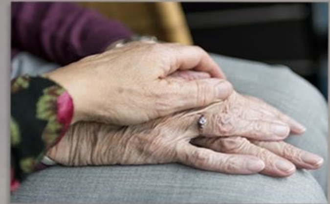
1970's and 1980's Worked in first Hospice in South Africa