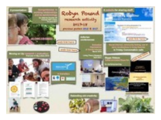
Robyn Pound alongsideness practice researcher