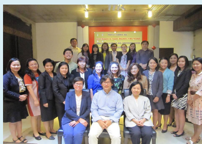
2015 IPST Action Research Workshop in Bangkok