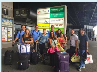
Action Research Tokyo Program