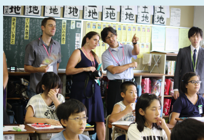
Japanese Lesson Study Day

About myself: My specializations are in educational psychology and educational research methods. At Waseda University Faculty of Human Sciences, I teach educational psychology, educational system assessment and research seminars. My recent research focuses on teacher expertise development, action research, lesson study, non-Western educational epistemology, inquiry-based teaching, achievement motivation, real world problem solving and the development of mathematical thinking.