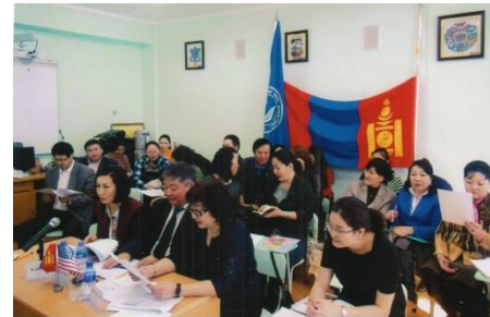
A FIRST ONLINE CONFERENCE WITH NMSU,USA