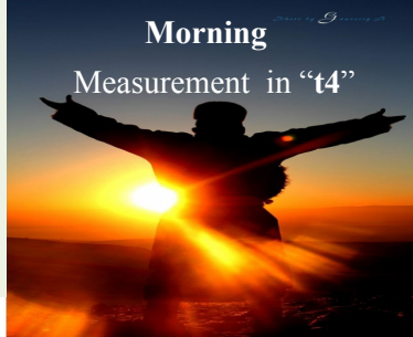
Morning Measurement in "t4"

Nomad's research question - How is "Tenger/ Sky/ Celestial Dome"? Object - the action* of nature or animals (the view of nature and animals life) Subject - an action of tenger