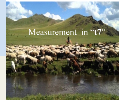
Measurement in "t7"