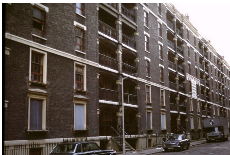
Figure 1: Gladstone Buildings where my father lived 1914–1940 (early 1970s prior to demolition)

Against this background, I shall now look backwards in time for the sources of my values, which may help to give them further expression within the context of this paper as a values-based account of my educational influence. Those sources begin, within my own memory of direct experience, with my four grandparents, who raised their children (my parents) barely 100 yards apart during the early years of the 20th century, in the tenement flats located in Shoreditch in the East End of London UK ( Figure 1 ). My father's family of six lived in three rooms in Gladstone Buildings and my mother's family of four lived in two rooms in Albert Buildings. It is worth noting that my mother and her sister were born 14 months apart – thereafter, their father owned a washable condom that lived on the side of the draining board next to the sink (as my mother reported when in her 70s).