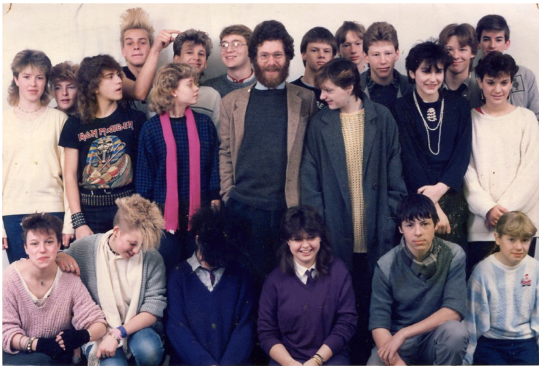
Figure 3: Working in a state comprehensive school, 1986

I like to think this 1986 picture shows that we are all at ease in each others' company and that there were no power relationship barriers between them as pupils and me as the adult teacher; there is a sense of fun and mutual respect that I now represent as the reciprocal expression of care . I remember feeling that education in my classrooms always worked at its best when the members of the class and I were able to 'bring out the best in each other' through caring in our own ways for each other.