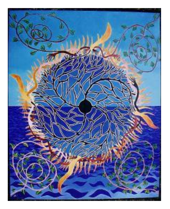
Figure 7. 'Holding Openness' (Oil painting on canvas by Alan Rayner, 2005). Light as a dynamic inclusion of darkness continually brings an endless diversity of flow-form to Life.

We like the way Alan Rayner (2010a) represents 'holding openness' in his 2010 keynote to the 8<sup>th</sup> World Congress of the Action Learning Action Research Association. We particularly like his understanding of 'holding openness' in terms of the co-creative, fluid dynamic transformation of all through all in receptive spatial context.