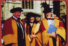
ACCESSING LIVING THEORY DOCTORATES AND MASTERS WRITINGS FROM HTTP://WWW.ACTIONRESEARCH.NET/LIVING/LIVING.SHTML AND HTTP://WWW.ACTIONRESEARCH.NET/