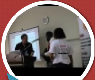
Text At St Thomas University, Mozambique 29 minute video

Keynote at 6th International Conference on 2-4 July - Israel. 23:35 minute