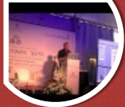
KEYNOTE AT NELSON MANDELA UNIVERSITY, SOUTH AFRICA IN AUGUST 2010 VIDEO 1:00:16 HOUR

Keynote at 6th International Conference on 2-4 July - Israel. 23:35 minute