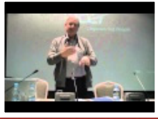
Workshop in Montenegro 11-13 November 2013 https://www.youtube.com/watch?v=CIfcExyiTk0 34:55 minutes

You can participate in on-going conversations with living-theory action researchers in the Community Space of the Educational Journal of Living Theories - see http://ejolts.net and contribute your own