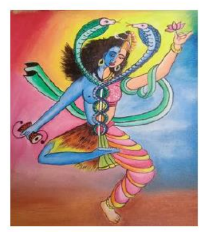
Figure 1: Ardhanarishwor, a Metaphor of a Harmonious Equitable space

Through presenting workshops, on a Living Educational Theory Research approach to continuing professional development in higher education, in Thailand, Canada, the USA, South Africa, South America, the UK, the Republic of Ireland, Kenya and South America, I have continuously reimagining our professional futures together with Living Educational Theory Research. Reflections on my responses to these workshops continues to help me to clarify and communicate my value of being a global citizen with an evolving awareness of cultural differences and influences. These influences include the value of an Ubuntu way of being from Africa (Charles, 2007) and a Satvic understanding from Hindu cultures (Dhungana, 2022):