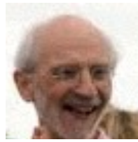
William House Community action, holistic medicine