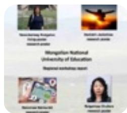
Mongolian Research gp democratization through education