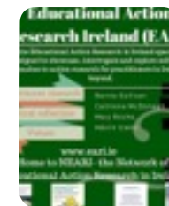
Educational Action Researchers Ireland ...a developing network of educators in Ireland