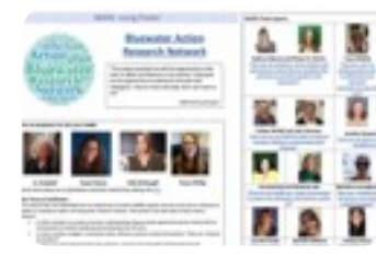
Bluewater Action Research Network ...a Canadian community of educators researching HE and school-based practice