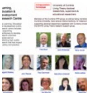
Univ. of Cumbria Living Theory Research gp. ...doctoral researchers & supervisors researching their diverse practice