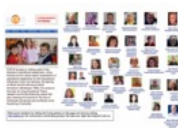
EJOLTS - Educational Journal Of Living Theories ...an international journal and community of Living Theory researchers