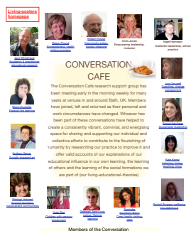
Conversation Cafe ...a community supporting developing practice in diverse fields meeting in and around Bath, UK, with occasional SKYPE visitors