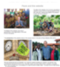
Revolution dressed Up as Gardening ...activists developing permacultural responses to improve the quality of life of communities around the world