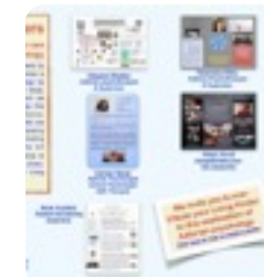
Adlerian SKYPE group Adlerian Living Theory researchers researching their practice together