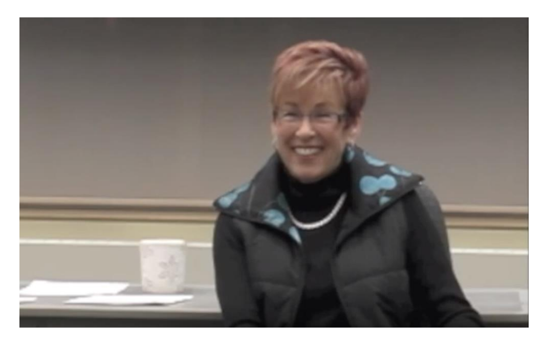
Figure 4. Democratic Evaluation: <a href="https://www.youtube.com/watch?v=SShZFmETpkk">https://www.youtube.com/watch?v=SShZFmETpkk</a>

Removing hierarchies is challenging and simply saying there is none is not acceptable. I found that in time and with trust, it developed but a significant strategy I found was committing myself to democratic evaluation.