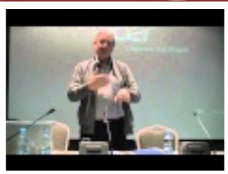
Workshop in Montenegro 11-13 November 2013 https://www.youtube.com/watch?v=C1fcExyiTk0 34:55 minutes