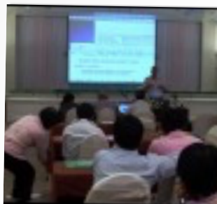
Day 5 of leading a workshop in Thailand 24 June 2013 - video 1:01:41 hours