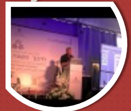
KEYNOTE AT NELSON MANDELA UNIVERSITY, SOUTH AFRICA IN AUGUST 2010 VIDEO 1:00:16 HOUR

Keynote at 6th International Conference on 2-4 July - Israel. 23:35 minute