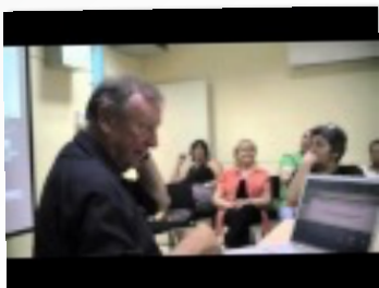
AT ORANIM COLLEGE ISRAEL 07/07/13 ON MULTIMEDIA NARRATIVES