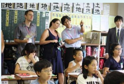
Japanese Lesson Study Day

About myself: My specializations are in educational psychology and educational research methods. At the University of San Diego, I teach psychological foundation of education, cognition and learning, human development, psychology of mathematical thinking and research method courses. My recent research focuses on teacher expertise development, action research, lesson study, non-Western educational epistemology, inquiry-based teaching, achievement motivation, real world problem solving and the development of mathematical thinking.