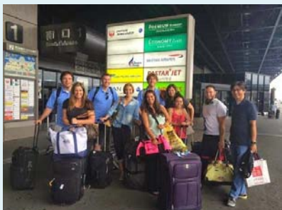
Action Research Tokyo Program