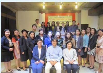
2015 IPST Action Research Workshop in Bangkok