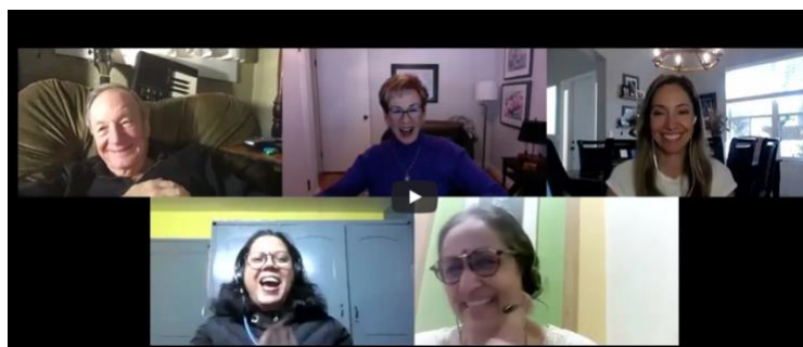
24:42 minute video at https://youtu.be/MbR2s6nWLZU