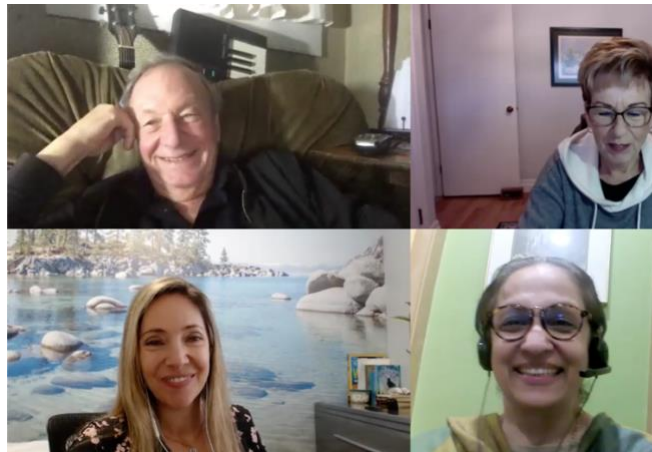
29:53 minute video at https://youtu.be/uIBXAKHiazM

The shared expressions around 0.11 minutes clarifies and communicates our meanings of a flow of life-affirming energy within our culture of inquiry.