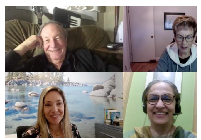
29:53 minute video at https://youtu.be/uIBXAKHiazM

In the planning meeting on Monday 10<sup>th</sup> January 2022, I checked that everyone was OK with me locating our relationships as cooperative and strategic relationships as we contribute to 'Cultivating Equitable Education Systems for the 21st Century in global contexts through Living Educational Theory Cultures of Educational Inquiry'?