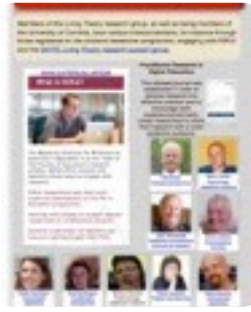
Univ. of Cumbria Living Theory Research Gp ...national and international doctoral researchers and supervisors researching their diverse practice.