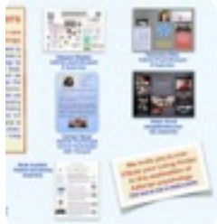
Adlerian SKYPE group Adlerian Living Theory researchers researching their practice together