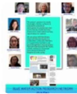
Bluewater Action Research Network ...a Canadian community of educators researching HE and school-based practice