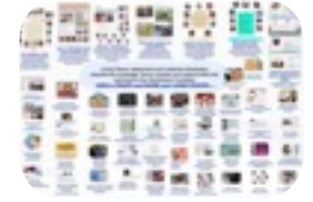
Living-poster 2015 homepage & posters

Back to actionresearch.net http://www.actionresearch.net