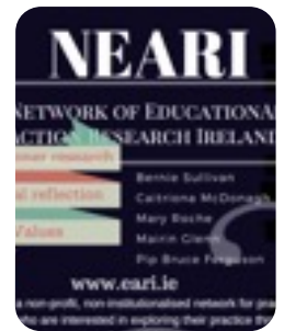
Network Educational Action Researchers of Ireland ...a developing network of educators in Ireland