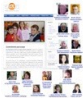
EJOLTS - Educational Journal Of Living Theories ...an international journal and community of Living Theory researchers