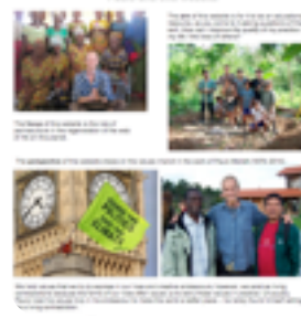
Revolution dressed Up as Gardening ...activists developing permacultural responses to improve the quality of life of communities around the world