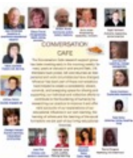
Conversation Cafe ...a community supporting developing practice in diverse fields meeting in and around Bath, UK, with occasional SKYPE visitors