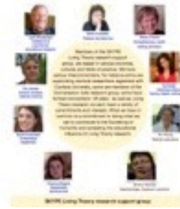
SKYPE Living Theory research support gp ...an international online community developing and supporting research and researchers