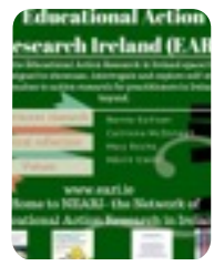
Educational Action Researchers Ireland ...a developing network of educators in Ireland