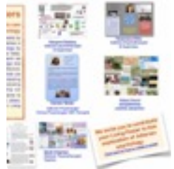
Adlerian SKYPE group Adlerian Living Theory researchers researching their practice together