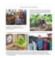
Revolution dressed Up as Gardening ...activists developing permacultural responses to improve the quality of life of communities around the world