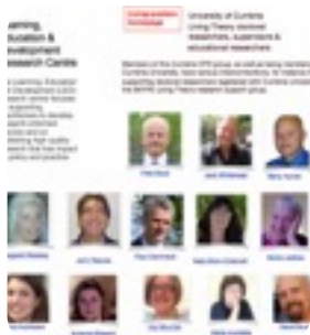
Univ. of Cumbria Living Theory Research gp. ...doctoral researchers & supervisors researching their diverse practice