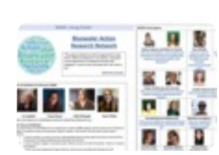
Bluewater Action Research Network ...a Canadian community of educators researching HE and school-based practice