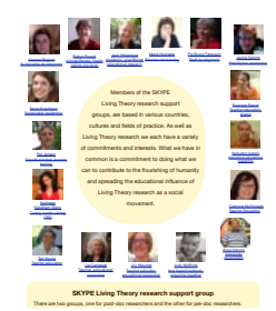
SKYPE Living Theory research support groups ...an international online community developing and supporting research and researchers