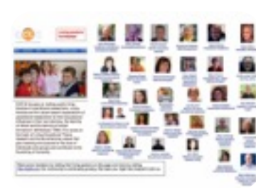
EJOLTS - Educational Journal Of Living Theories ...an international journal and community of Living Theory researchers