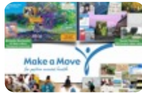
Make a Move Research Group promoting positive mental health