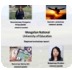
Mongolian Research gp democratization through education