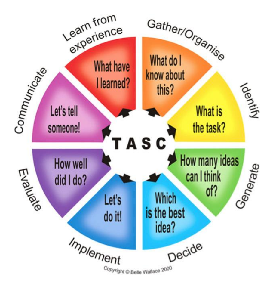
Figure 1. The steps of enquiry in the TASC approach (Wallace et al., 2004)

What we like about TASC is the clarity of the systematic form of action-reflection cycles in disciplining our enquiry. Mounter (2007) has used the TASC wheel with 6 and 7 year old pupils who have suggested improvements in the two dimensional model to include a further dynamic dimension. We agree with this modification. We, including the children have particularly focused on the nature of 'what have I learned?' and 'let's tell someone'. We have included what we have learned in our explanations of educational influence in learning, as our living-educational-theories.