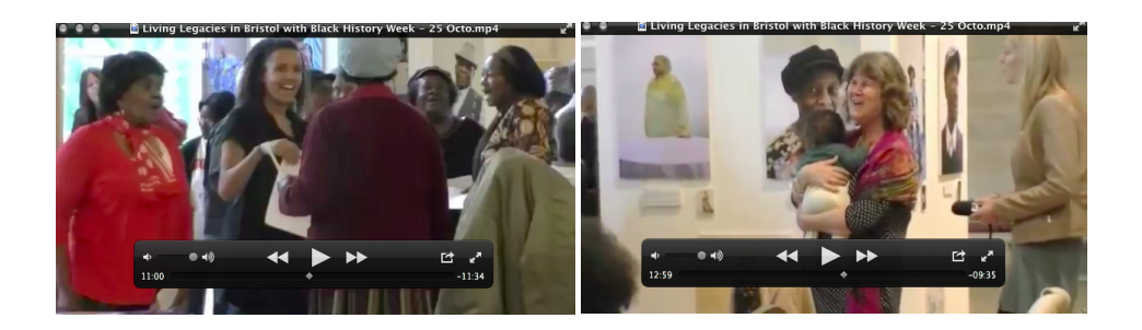
14:47 to 17:12 minutes - Diana

10.08 to 14:40 minutes – By the rivers of Babylon