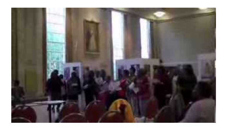
22:35 minute video at <a href="http://www.youtube.com/watch?v=4mcqC6yKBe0">http://www.youtube.com/watch?v=4mcqC6yKBe0</a>

You can quickly download all of this clip onto your desktop using the Firefox Browser with the free application Download Helper. You can then drag and drop it into quicktime and move the cursor along the clip to where you want to play it.