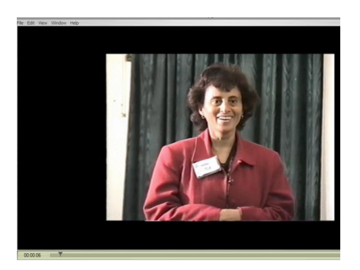
Figure 39 Institutional Symposium held September 2001 http://youtu.be/-bk97Q3w8Do

The second video-clip (<u>http://youtu.be/-bk97Q3w8Do</u>) (SOP 24, How do I present at a <u>Symposium?</u>) – Figure 39 was recorded at an Institutional Symposium on Curriculum Innovation: Promoting Information and Communication Technology to promote Active Learning which was held at the Rob Roy Hotel on 18 September 2001. This symposium provided an opportunity for all academic staff to share their good practice in the design of learning materials that embed Communications and Technology. We were sharing as part of the community of practice. Each person had a chance to share their use of computers to develop games for active whole-being-learning . The empathetic resonance can be experienced in this videoclip at 2:16; 2:55-2:59; 3:23-3:30; 9:13 – 9:17 minutes. The critical incidents are when I am displaying passion and excitement for what I am doing as I share about the setting up of the ELC. The passion and excitement is evident from the movement of my hands and body and in my facial expressions which are all spontaneous.