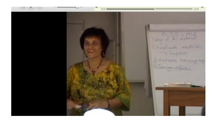
Figure 40 Development workshop for staff from a different institution http://youtu.be/qi1W2cKTMpE

The teachers were interested in designing learning materials for their students who were generally weaker in understanding the language of instruction. I was invited to share the process of designing innovative materials that we had developed. I held an interactive workshop during which time we all shared our experiences of designing and developing learning materials.