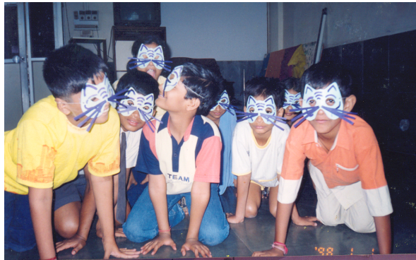
Identical cat masks.

This step in Cycle 3 also served as the beginning of whole group work as I did not divide the children in twos or threes, but the class in union experimented with cat like movements, all looking and moving in a similar fashion.